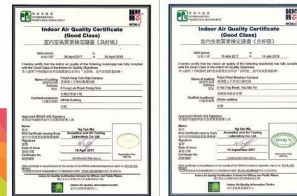
The HHB and WK Campuses were presented with the IAQ certificates. 紅磡灣及西九龍校園獲得室內空氣質素證書。

除了完善的校園設施外，CPCE亦致力為同學及教職員提供良好的室內空氣質素。於香港特區政府的自願室內空氣質素檢定計劃中，紅磡灣及西九龍校園繼續符合辦公室及公眾場所的室內空氣質素檢定標準，於2017年再度獲得「良好」評級。