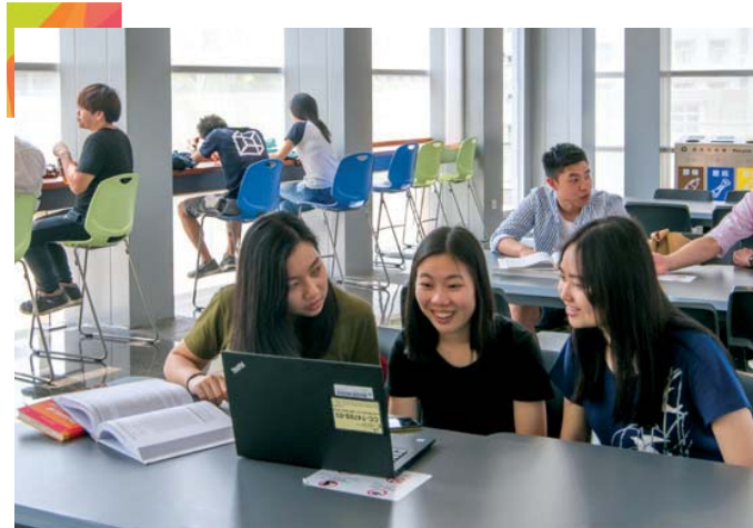
Students are provided with loan service of tablet or notebook computers. 學生可享用手提或平板電腦借用服務。

During the year, the CPCE Libraries also organised "The Electronic Resources Week" to publicise the benefits of using e-books, e-journals and e-databases among staff and students. The growing adoption of electronic resources would facilitate the continual expansion of library collections without any physical space constraints.