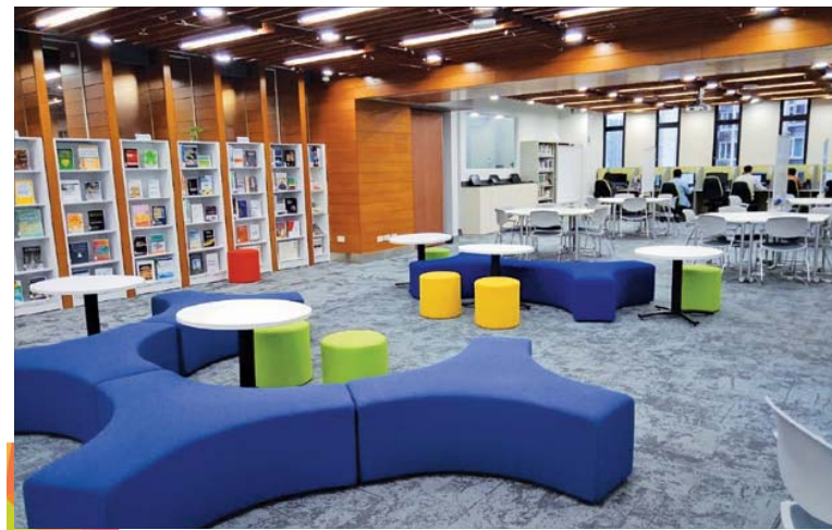
Multi-purpose learning area in the PolyU HHB Library 理大紅磡灣校園圖書館的多用途學習空間