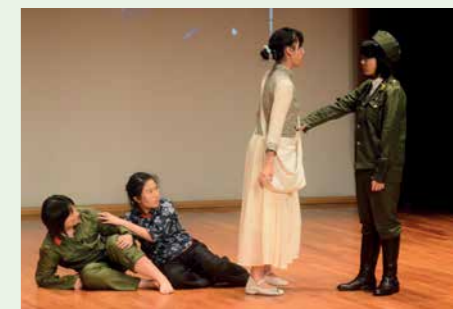
Students performed their own wonderful drama in the competition.

此項SCOLAR資助的計劃，結合普通話學習及戲劇培訓，旨在提升中學生的普通話水平。計劃安排24所本地中學逾240名學生參與各種有趣的活動，包括培訓工作坊、研討會，以及香港演藝學院、鳳凰衛視、香港電影資料館和香港電視台的導賞活動。參加同學於2018年5月進行普通話戲劇匯演比賽，同年10月及11月將舉行成果展覽及分享會暨頒獎典禮。